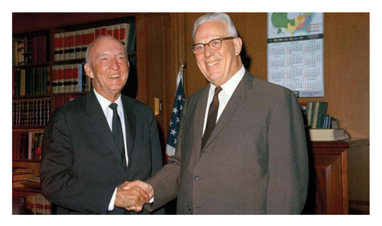
U.S. Chief Justice Earl Warren and Justice Hugo Black in 1966.