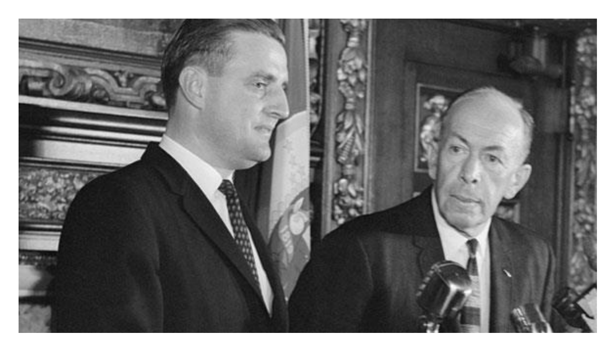
Minnesota Attorney General Walter Mondale with Gov. Karl Rolvaag in 1964.

observed, "In the end, states are always strapped," but they make choices on how they allocate their criminal justice budgets, and even when they are broke they find ways to "pay the prosecutor."