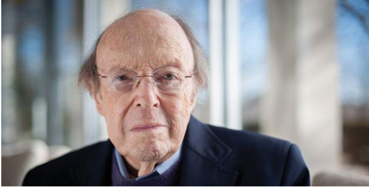
Anthony Lewis, author of Gideon's Trumpet.