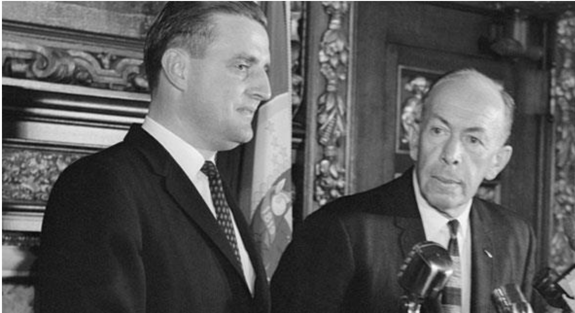
Minnesota Attorney General Walter Mondale with Gov. Karl Rolvaag in 1964.

observed, “In the end, states are always strapped,” but they make choices on how they allocate their criminal justice budgets, and even when they are broke they find ways to “pay the prosecutor.”