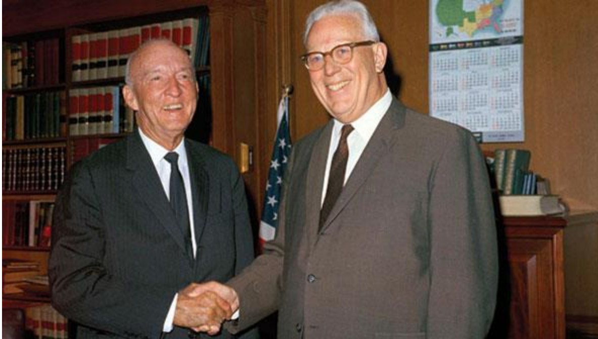
U.S. Chief Justice Earl Warren and Justice Hugo Black in 1966.